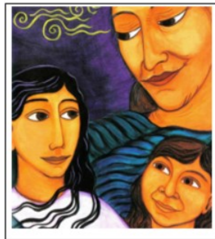
Artwork by Maya Gonzalez

Located in the original homelands of the Kumeyaay, San Diego's South Bay is a diverse borderlands community that includes San Ysidro, Chula Vista, National City, and South San Diego. It is home to a large Latina/o/x population and many bicultural and bilingual (im)migrants. We will primarily collaborate with California Latinas for Reproductive Justice's "speaking story" project ( https://californialatinas.org/ ) and Casa Familiar ( http://www.casafamiliar.org/ )